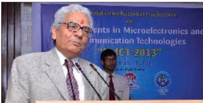
President, IETE addressing the audience

The conference was successful in its efforts to increase awareness and knowledge among scientists, researchers and students about education and research being carried out in India in the areas of Micro Electro Mechanical Systems (MEMS) and NANO Engineering.