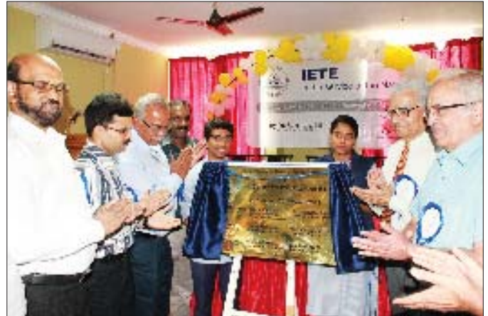
Inauguration of PAC at Trissur