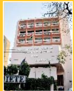
IETE HQs, New Delhi