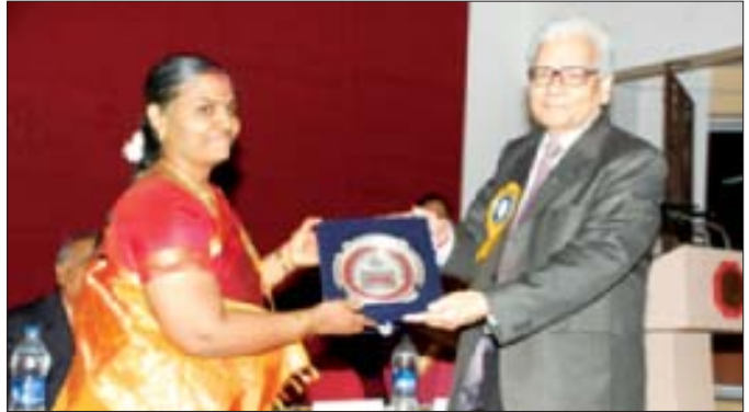
President, IETE giving Memento to Chairperson, IETE Sivakasi Centre